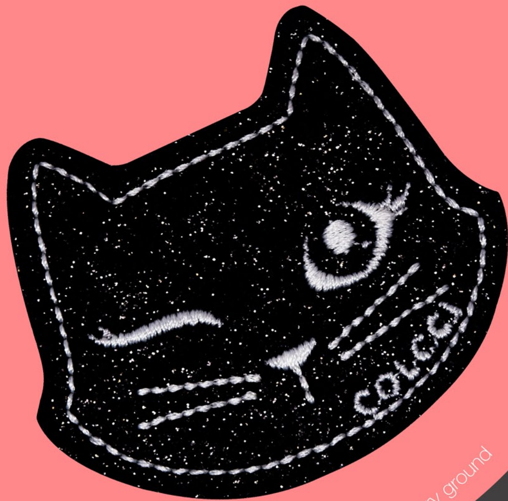
embroidered patch with glittery ground