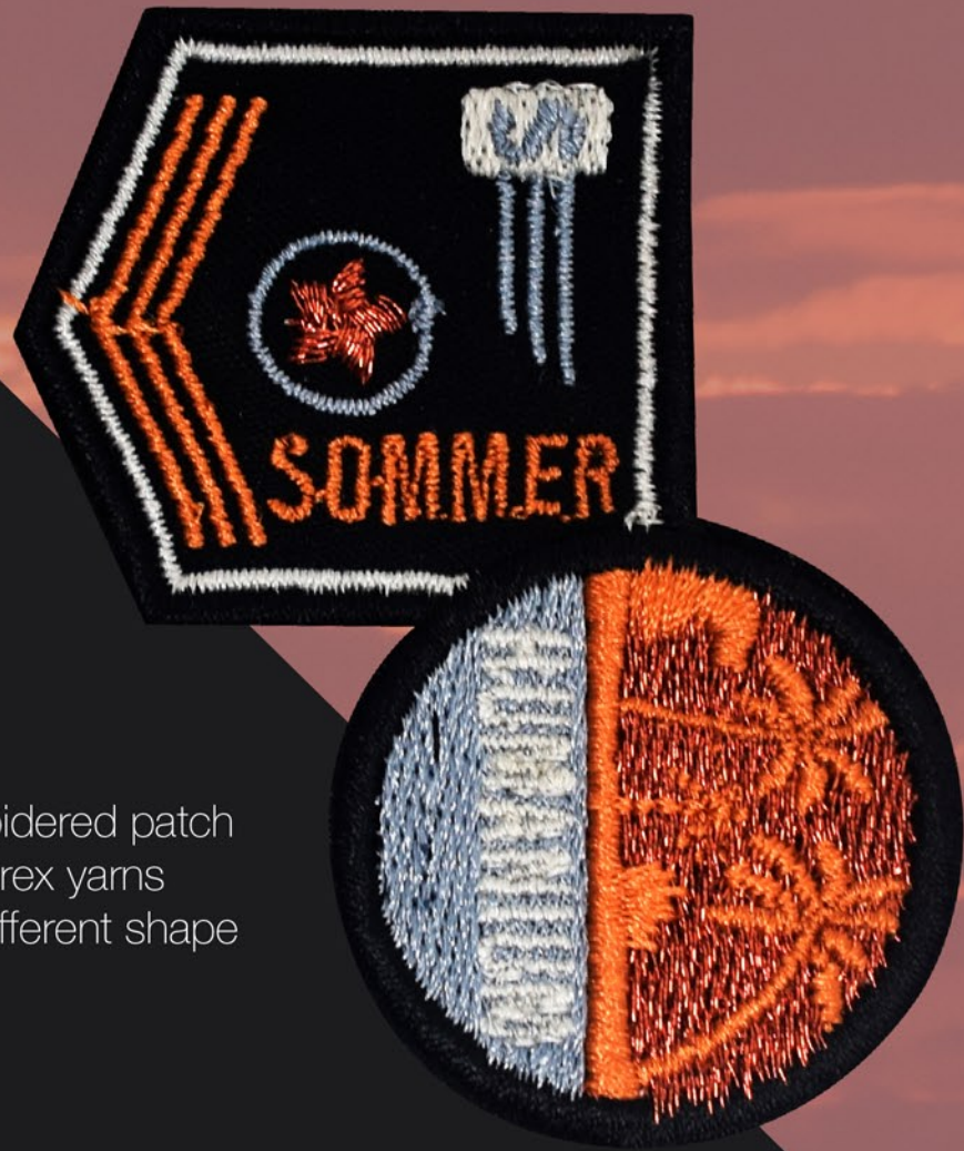
embroidered patch with lurex yarns and different shape