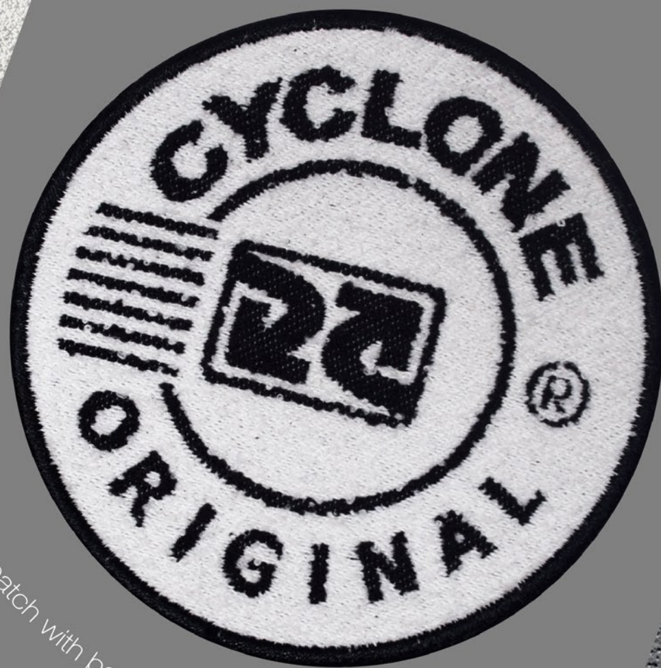
patch with boucle yarn and embroidered edges