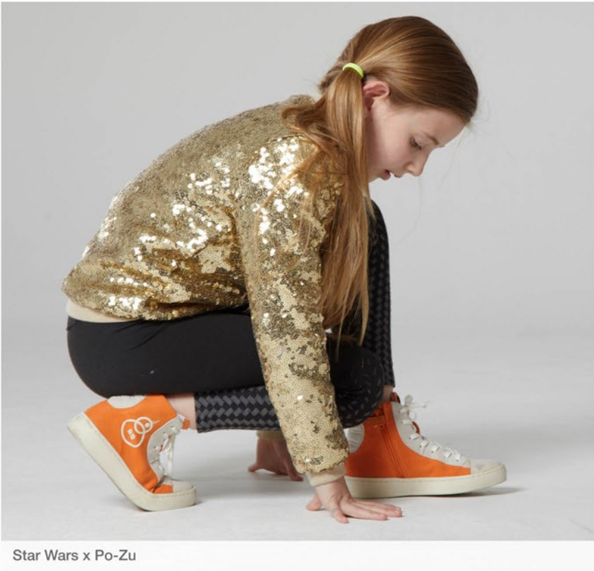
Star Wars x Po-Zu

Finishes: 137 Embroidery, 155 Heat Sealed Backing – Film, Manual Cut