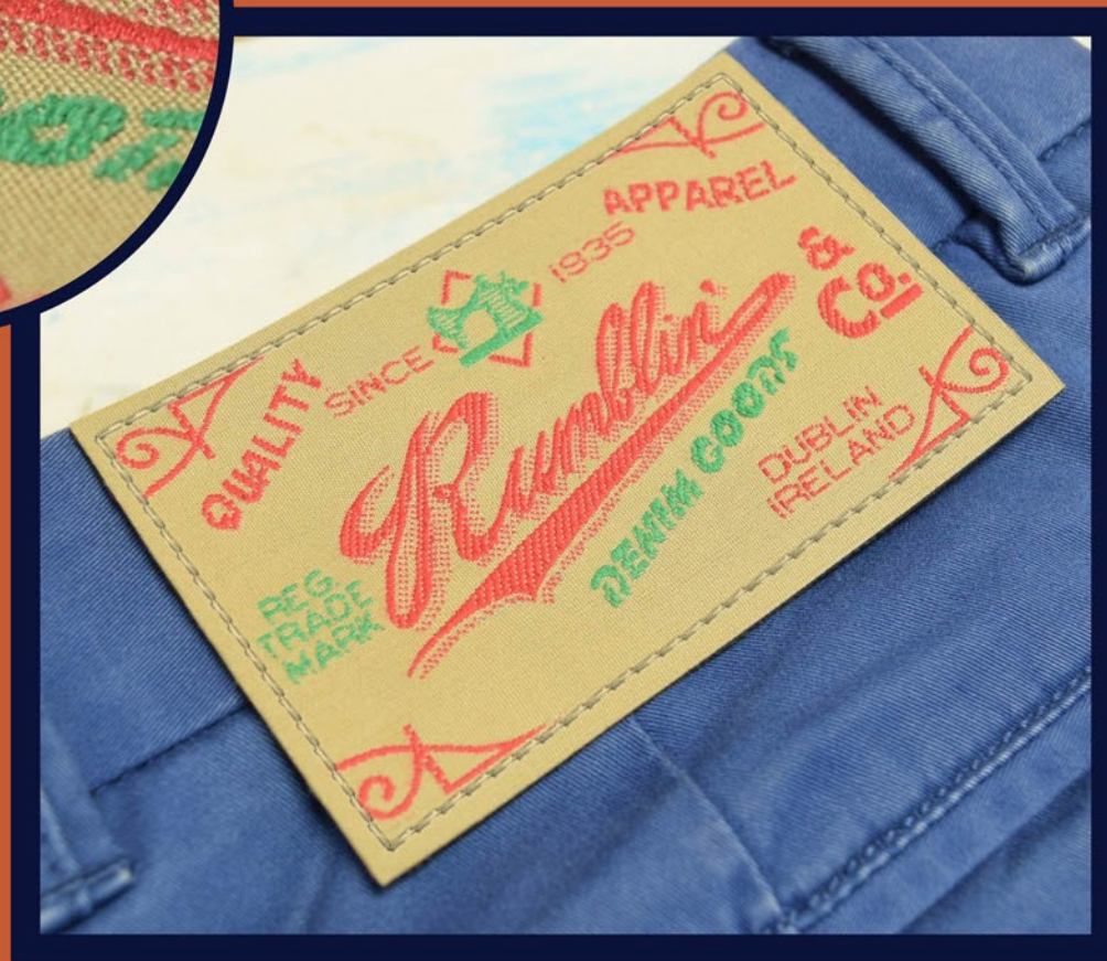
COTTON LABEL, PRODUCED IN SPECIAL SHUTTLE LOOM