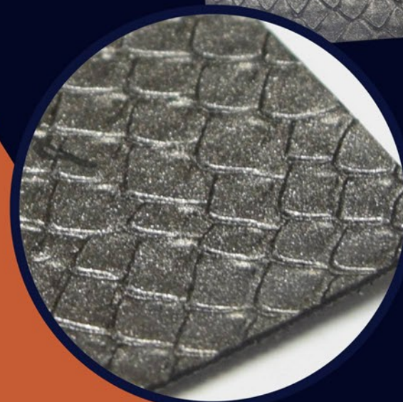
METALLIC ANIMAL PRINT