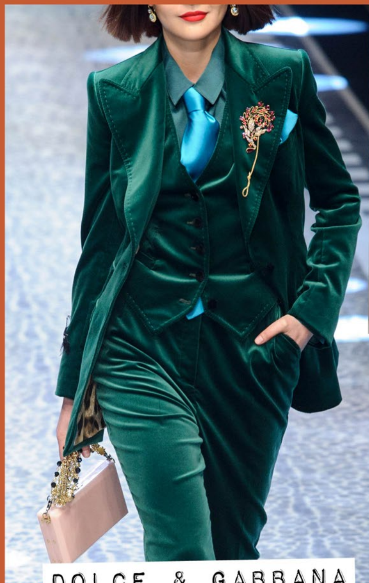
DOLCE & GABBANA