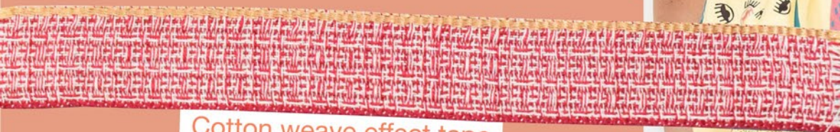
Cotton weave effect tape