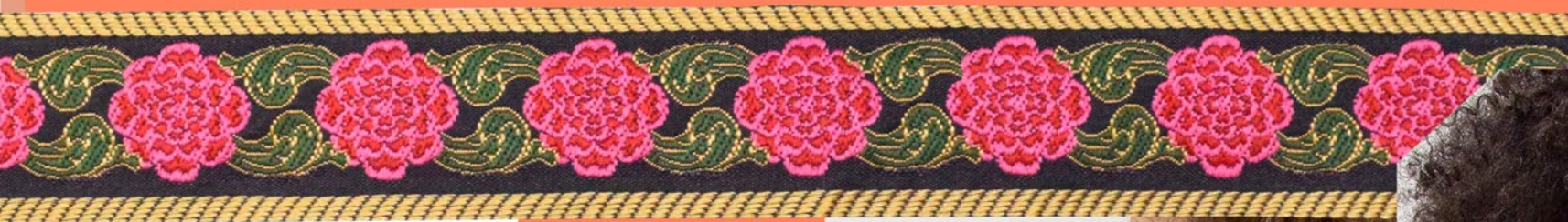
Bright Greek polyester ribbon