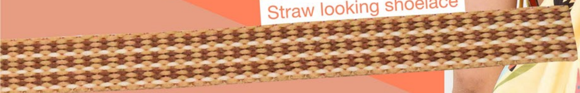
Straw looking shoelace