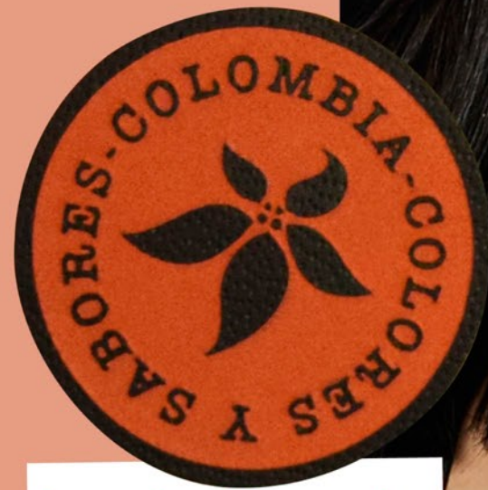
Decorative with engraving