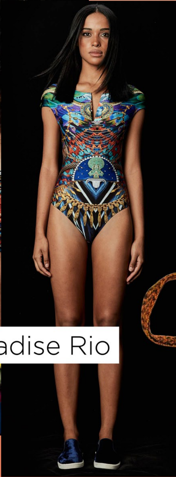
The Paradise Rio